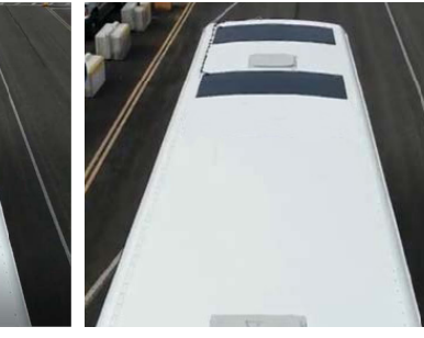
2 panel - 720W system shown